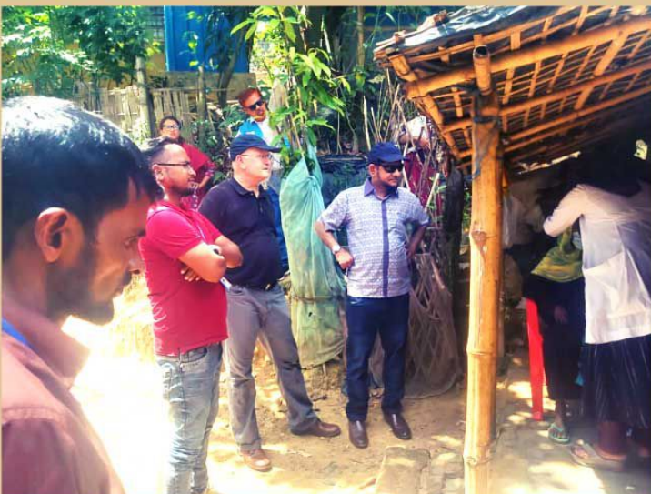
Field visit by Donors at Host Community

ACLAB Regional Office Chowdhury Bari, East Larpara, Buserterminal, Cox's Bazar Email: dahasan2014@gmail.com